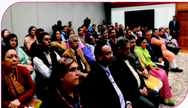
Officers of ICHR & Ministry of Culture during the address of the Hon'ble Prime Minister

The background to the project is as follows: A project to compile a national register of martyrs was initiated by the National Implementation Committee for organising celebrations of the 150 th anniversary of the uprising of 1857 and 60 years of India's independence. The ICHR accepted the project and necessary funds at the request of the Ministry of Culture, Government of India. An