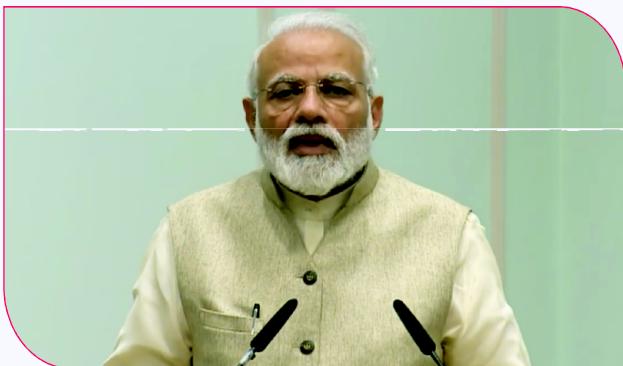
Hon'ble Prime Minister Shri Narendra Modi Ji addressing the gathering.

It is matter of great pride that the Hon'ble Prime Minister of India, Shri Narendra Modi ji released the complete set of 5 volumes of the project titled Dictionary of Martyrs: India's Freedom Struggle (1857-1947) at his official residence, 7 Lok