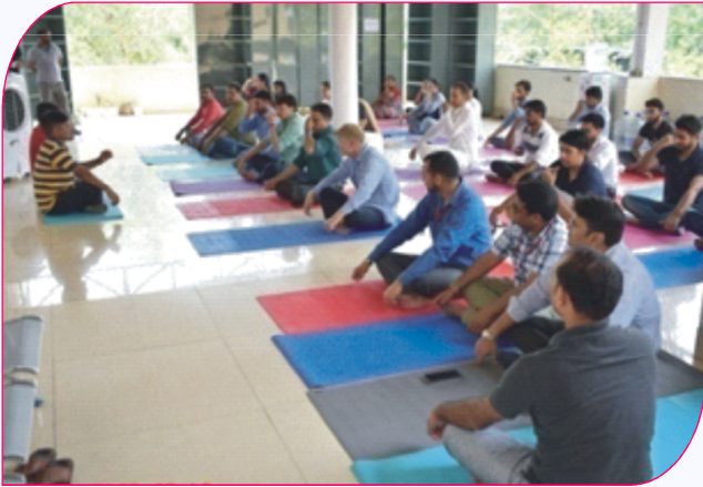
ICHR Officials and Staff member taking part in Yoga.

Yoga Day : The ICHR observed Yoga Day with great zeal and enthusiasm on the occasion of 5 th International Yoga Day i.e. on 21 June 2018.