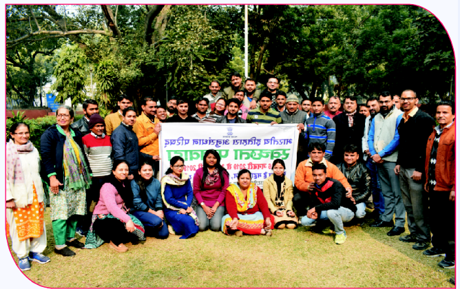
ICHR Officials participating in Swachhata Pakhwada.

Swachhata Pakhwada : There was a campaign for Swachhata Pakhwada from 14-31 January 2019. The staff members of the Council took part in it.